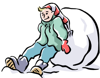
Help children stay safe and warm when playing outside.

Parents should take the following precautions: